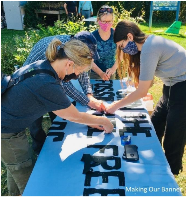
Making Our Banner