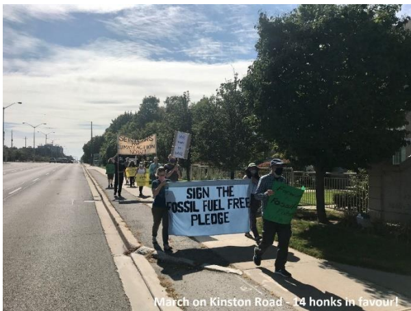
March on Kinston Road - 14 honks in favour!